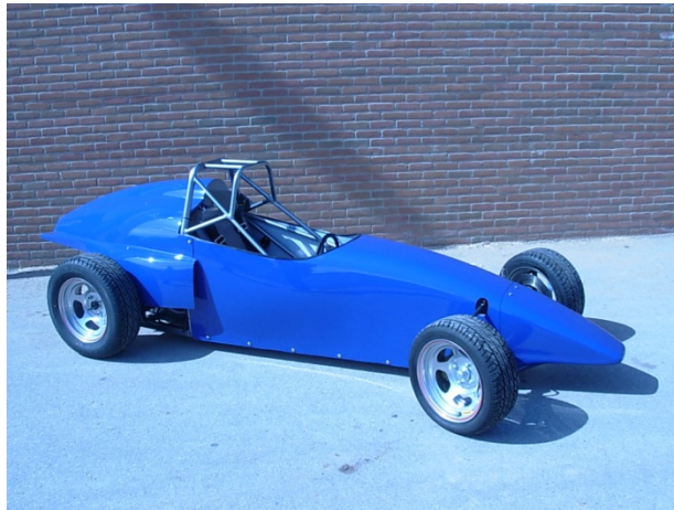
The car before firewall installation (above)

A lot has happened since the last update. The body was fully painted by NWTC. It was painted the iconic NAPA blue color. The chassis assembly with all the parts and engine is fully completed and the seat and seat belts are installed. With everything fully installed onto the chassis, it was now time to take the car apart and prep the chassis for painting. We used Brillo pads and sanders on the now bare chassis to rough up the steel and we used a virgin solvent to remove any grease and grime from the steel chassis. We sent the chassis to Renco Machining inc. where it was painted. While the chassis was getting painted, the team used spray paint to paint the other parts of the vehicle. Once the chassis was returned from Renco Machining, we began to re-assemble the car and design and create decals to place on the body of the car. On Thursday, April 1 st , we completed the re-assembly of the NAPA car with the completion of the firewall. The car is now completed minus the body decals.